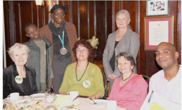
The first Xclusivenigeria International Lecture, co-sponsored by the New York City branch of the American Association of University Women (AAUW.org) and by Medical Journal of Therapeutics Africa (mjota.org), was held on November 06, 2009 in Manhattan.