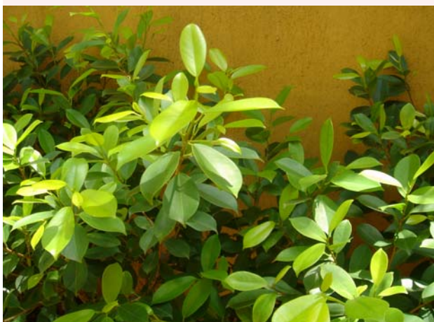
House in Lagos. Mosquitoes breed in clean water that pools in banana leaves, on tops of walls, particularly in broken glass bottles that are embedded on tops of walls for security.

ing program.(12,13) A meta-analysis of studies attempting to correlate incidence of breast cancer with DDT exposure found no increased risk from DDE load.(14)